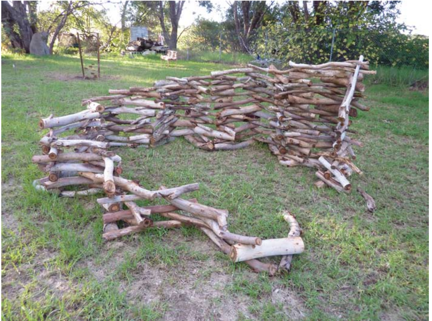
Angilene Phoenix We can't go on like this