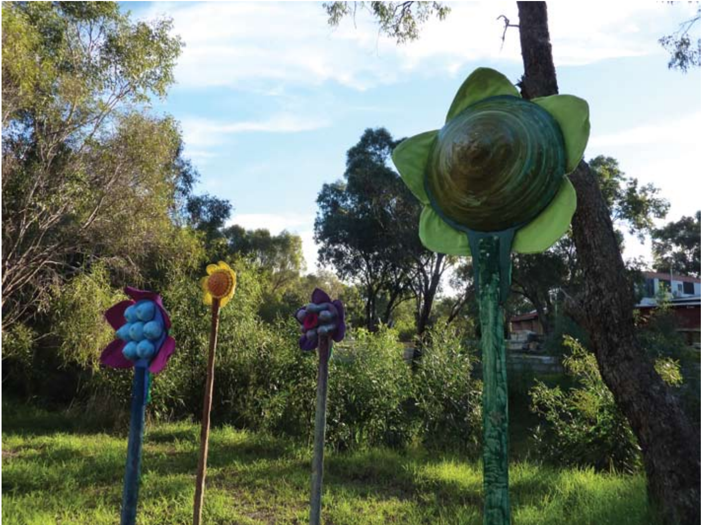
Amber Farley Picking Flowers